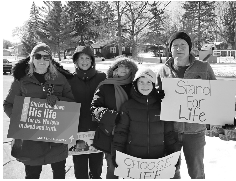
Berrien County Right to Life's Walk for Life (January 25, 2025)

Many Right to Life of Michigan affiliates hosted a local March or Walk for Life in January to mark the 52nd anniversary of the U.S. Supreme Court's Roe v. Wade decision. Prolifers across the state joined both in celebrating the overturn of Roe in 2022 and in commemorating and mourning the more than 63 million lives lost to abortion under nearly 50 years of Roe.