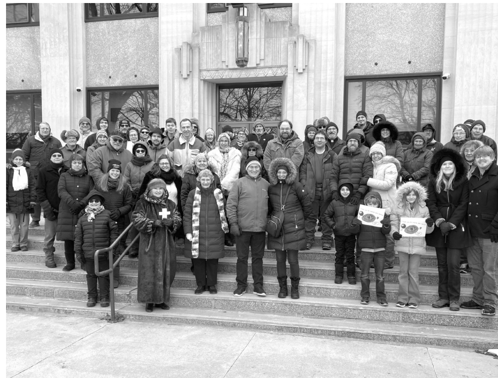
Tuscola County Right to Life's Sanctity of Human Life memorial service at the County Courthouse (January 19, 2025)