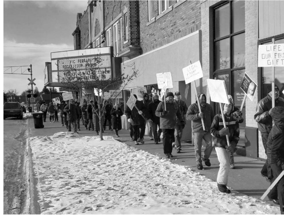
Dickinson County Right to Life's Walk for Life (January 22, 2025)