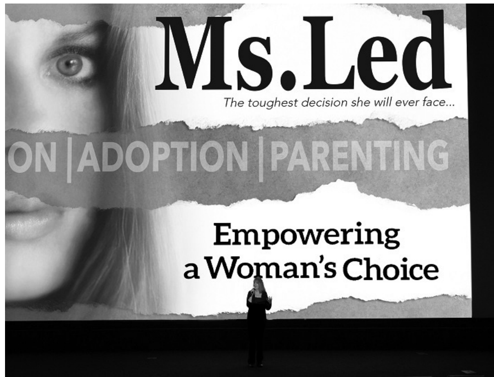
Grand Rapids Right to Life hosted a screening of the prolife documentary Ms.Led (August 1, 2024)