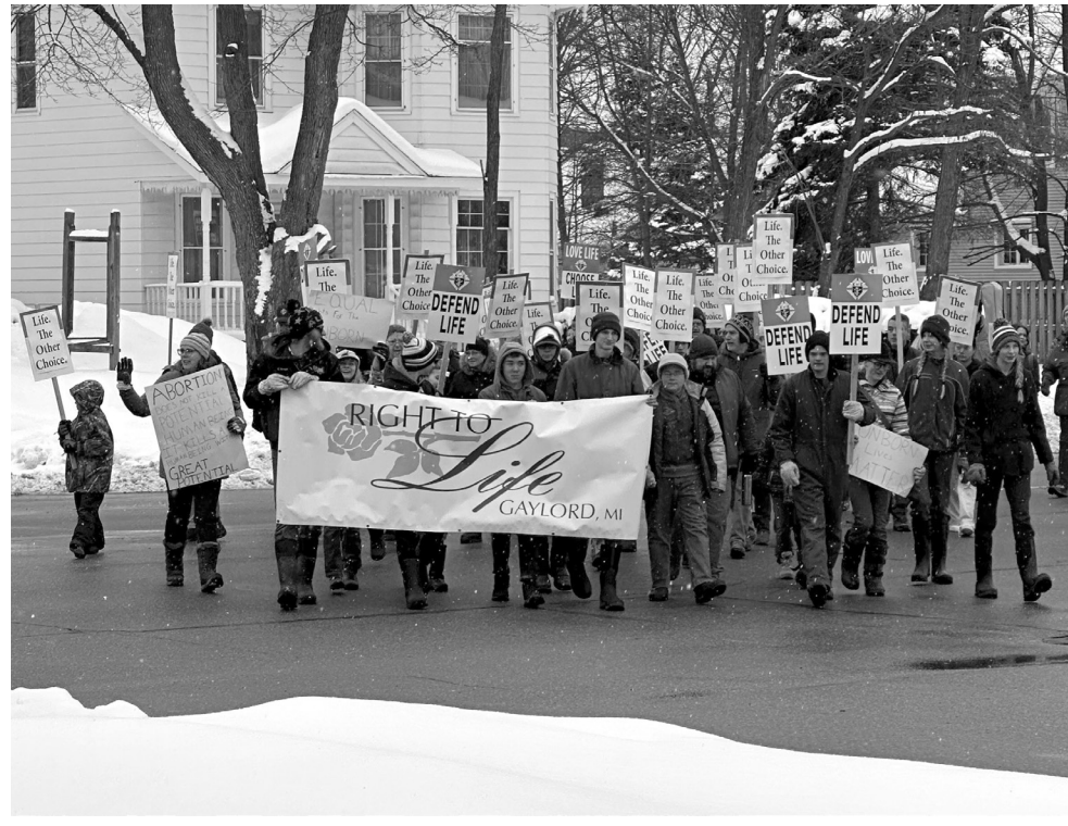
Gaylord Right to Life's March for Life (January 24, 2025)