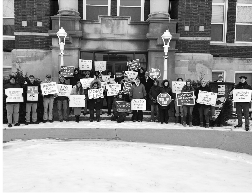
Sanilac County Right to Life's March for Life (January 19, 2025)