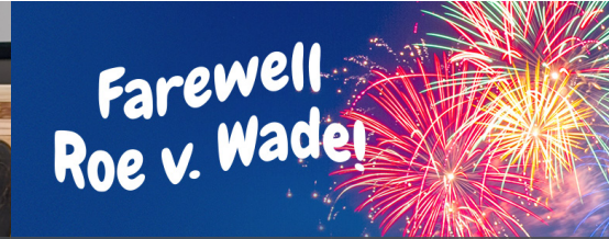
DOBBS V. JACKSON WOMEN'S HEALTH ORG.