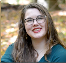
PROLIFE YOUTH AWARD WINNER