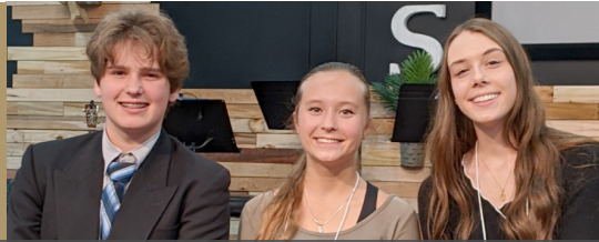
ORATORY CONTEST WINNERS