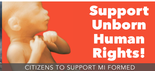
CITIZENS TO SUPPORT MI FORMED