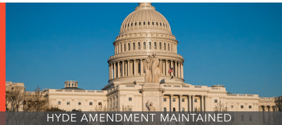
HYDE AMENDMENT MAINTAINED