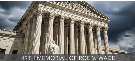
49TH MEMORIAL OF ROE V. WADE