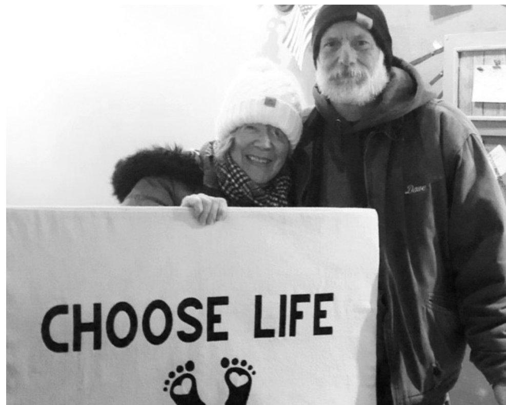
Ogemaw County Right to Life held a local march to honor the unborn 51 years after Roe v. Wade was ruled (above).