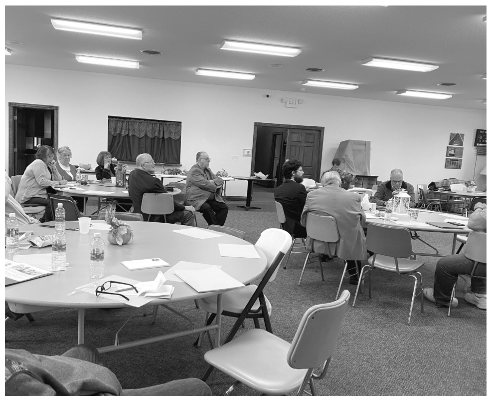
Clare County Right to Life held a pastor's event last fall (above).