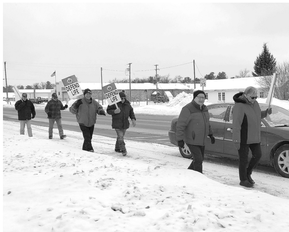
Oscoda County Right to Life held a local march to honor the unborn 51 years after Roe v. Wade was ruled (above).